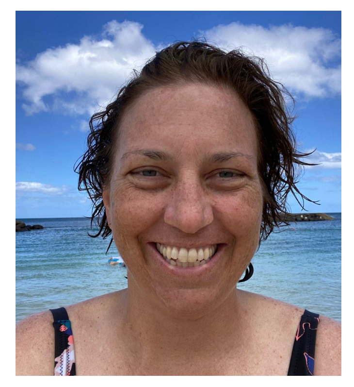
Family mealtimes make magical memories, thanks to you.