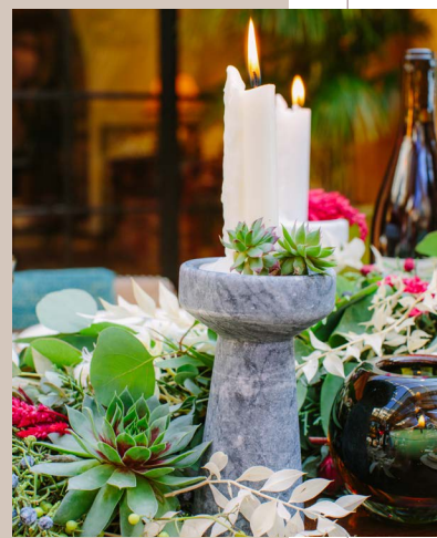
Candle holders, Celadon House EmmaRose florals

The problem? It's nearly impossible to keep a traditional live wreath from drying out and browning before Christmas comes around. The solution? Two words: Succulent. Wreath. Let EmmaRose Floral do all the work of creating a long-lasting wreath using some of the most recognizable little succulents, "hen and chicks." emmarosefloral.com