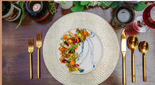
Roasted Forelle Pear and Baby Beet Salad with gorgonzola cream, arugula, toasted walnuts Eliana Bernard plate, Millworks Goblet, Millworks