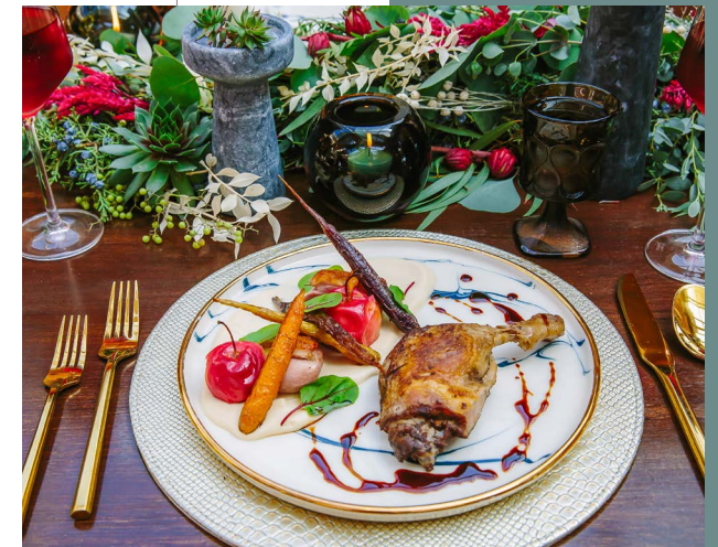
Crisp Roasted Duck Breast and Confit Leg with parsnip-peanut puree, smoked heirloom carrots, grilled crab apple, aged balsamic

Trust us, it's always summer around here. Because we live by the beach, it's totally appropriate to give your favorite beach essentials as holiday gifts. Our four go-to's hail from Montecito's Coco Cabana, the one-stop-shop for all of your seaside accessories. This year, we're picking up the Red Flamingo Beach Towel (La Serviette Paris, $179), Venus Anklet (Pachulah, $200), Ursula Clips in Mint (Valet Studio, $45), and the Ibiza Hat in Natural (Artesano, $220) to put in our stockings. ilovecococabana.com