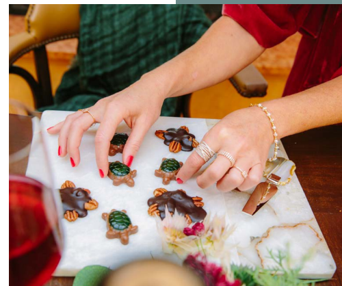
Serving platter & knives, Celadon House Chocolats du CaliBressan turtles

It's hard to feel guilty about indulging in decadent chocolate when it's gifted to you... Stop by Santa Barbara's local chocolate maker, Chocolats du CaliBressan, and pick up a couple of their edible turtles for your loved ones with a major sweet tooth. chococalibressan.com