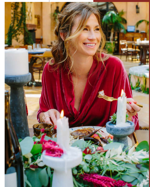
Molly Pepper velvet robe, molly-pepper.com

The spa at Four Seasons Resort the Biltmore may not have live swans a-swimming, but who doesn't love a gift certificate for all-day beachside pampering? (We'll give you a hint: no one.) fourseasons.com/santabarbara/spa