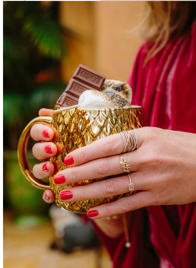
S'mores Hot Cocoa cocktail