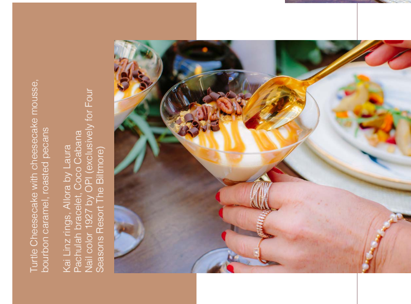
Turtle Cheesecake with cheesecake mousse, bourbon caramel, roasted pecans Kai Linz rings, Allora by Laura Pachulah bracelet, Coco Cabana Nail color 1927 by OPI (exclusively for Four Seasons Resort The Biltmore)