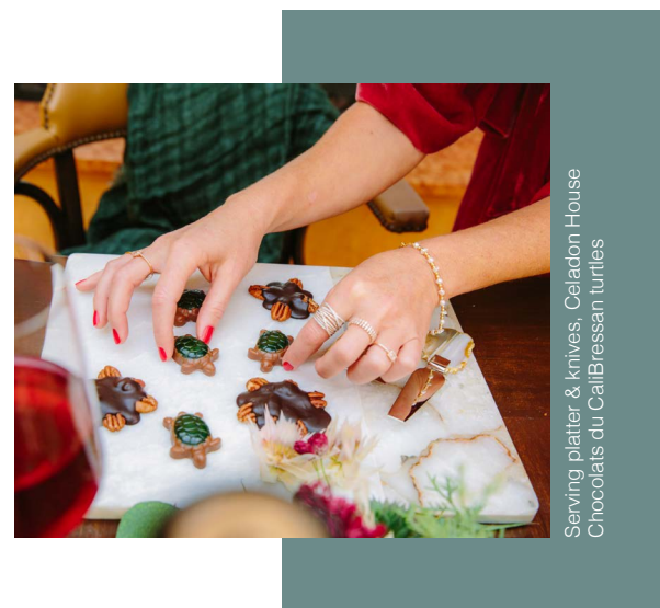
Serving platter & knives, Celadon House Chocolats du CaliBressan turtles

House of Honey | 525 San Ysidro Rd, Santa Barbara, CA 93108